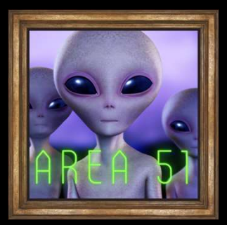
Area 51 (10+) 2/5 Difficulty | 2 - 6 Players Can your team escape the imminent alien invasion?