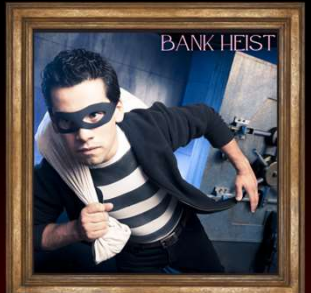
Bank Heist (10+)

3/5 Difficulty | 2 - 6 Players Your team has been hired to perform a heist! Hack through the security systems and retrieve your share of the million dollars inside.