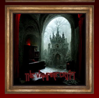
The Vampire Crypt (10+)

3/5 Difficulty | 2 - 6 Players Your team has been hired to perform a heist! Hack through the security systems and retrieve your share of the million dollars inside.